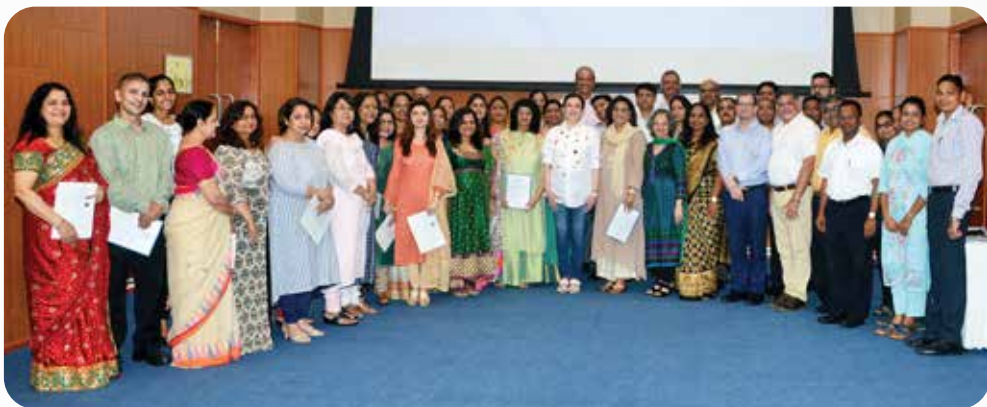
DAIS staff completing 5, 10 and 15 years of service with our Founder and Chairperson, Smt. Nita M Ambani

Our focus is to create an atmosphere of learning that children enjoy, and one that encourages them to discover and express their talents to the fullest. We are driven by the belief that every child is important and should be at the heart of every educational endeavour. This underpins all our efforts to inspire and enable each child to believe in and practise our motto, 'Dare to Dream...Learn to Excel'.